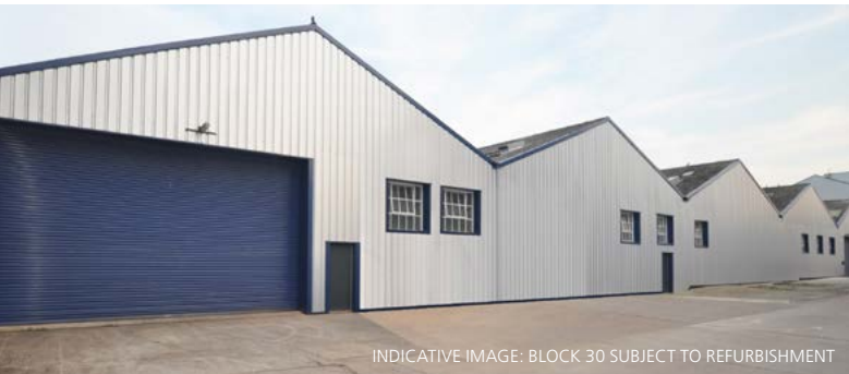
INDICATIVE IMAGE: BLOCK 30 SUBJECT TO REFURBISHMENT