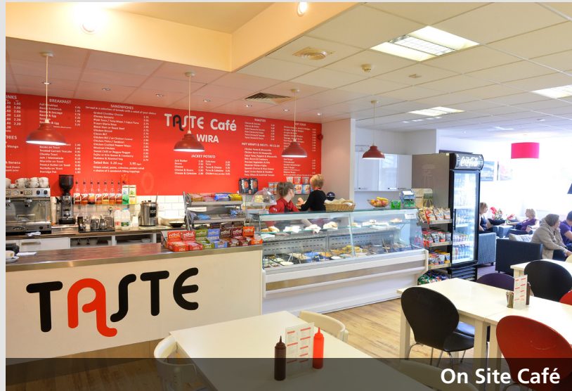
On Site Café