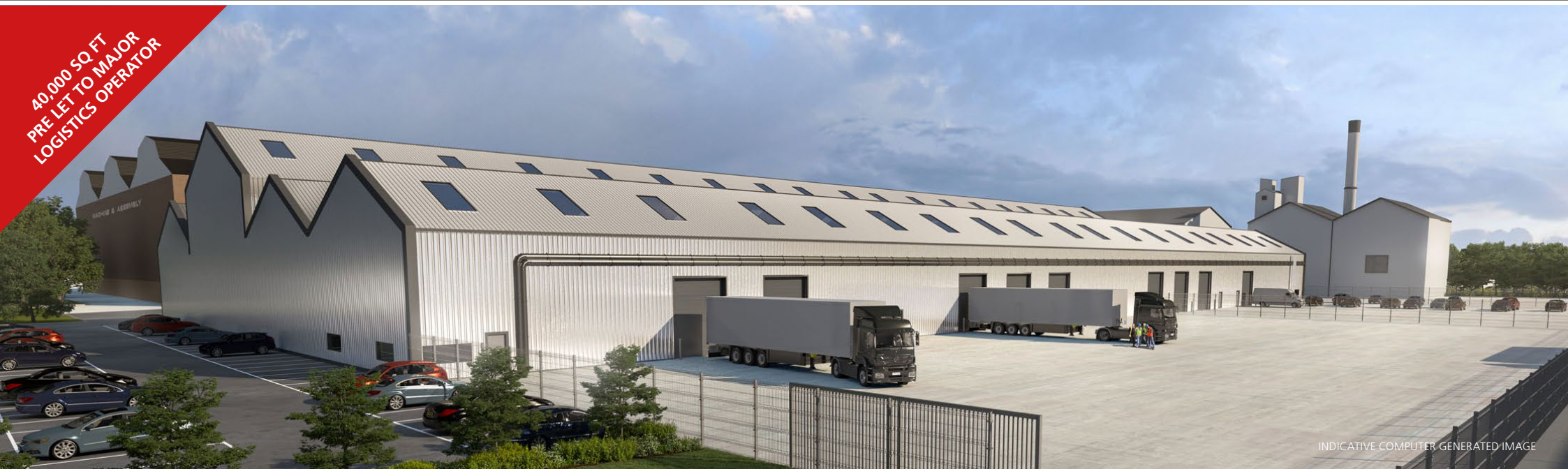
INDICATIVE COMPUTER GENERATED IMAGE

40,000 SQ FT PRE LET TO MAJOR LOGISTICS OPERATOR