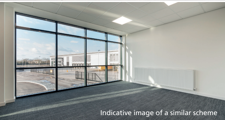
Indicative image of a similar scheme