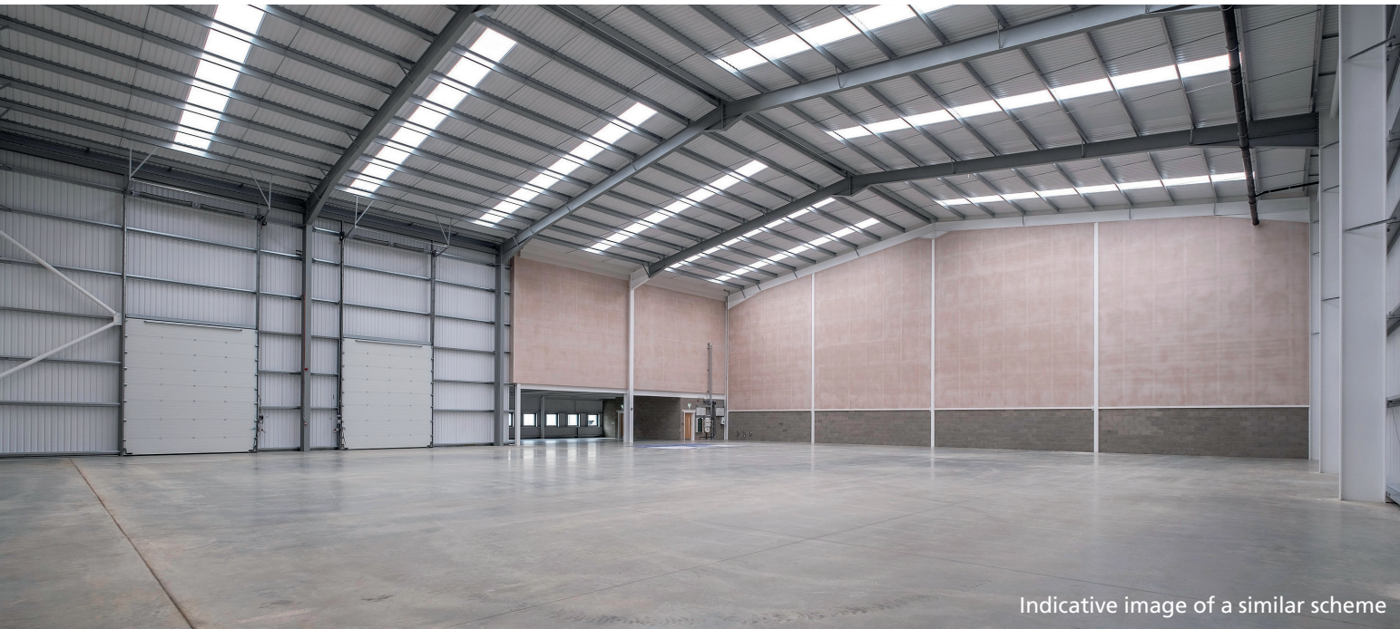
Indicative image of a similar scheme

WESTWAY COURT ■ GLASGOW AIRPORT ■ PA3 2EW