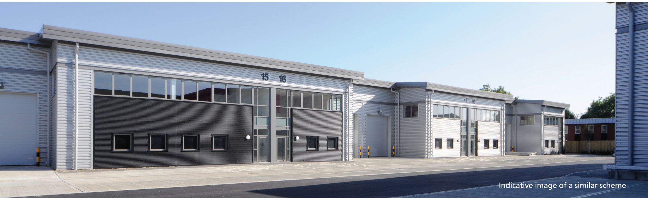
Indicative image of a similar scheme