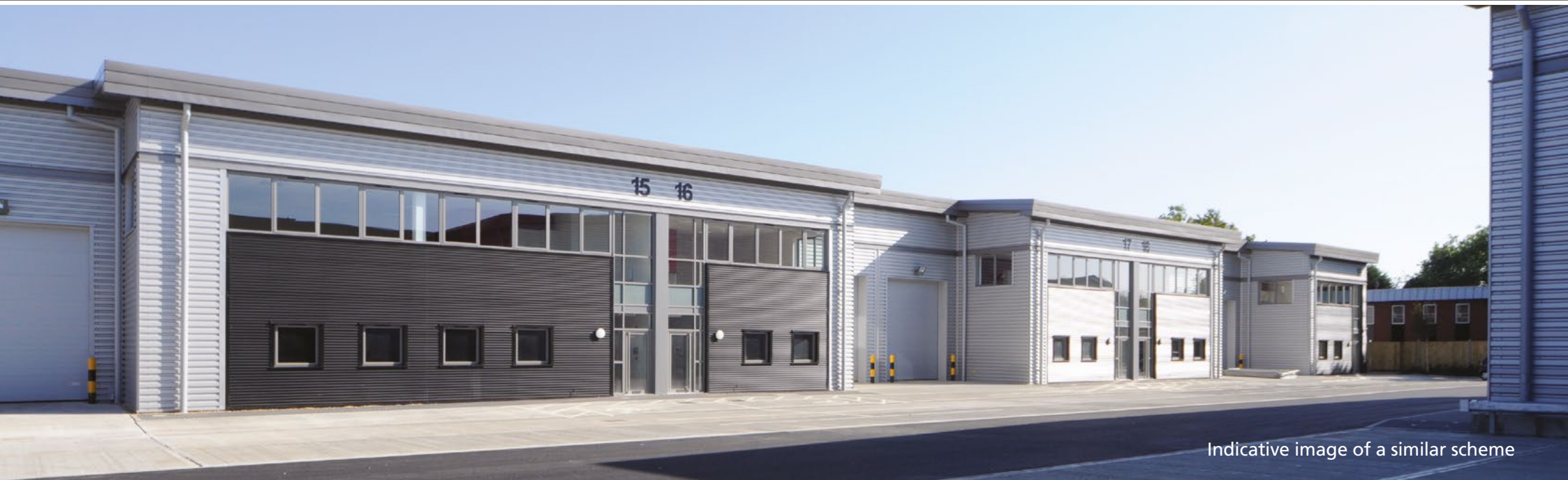
Indicative image of a similar scheme