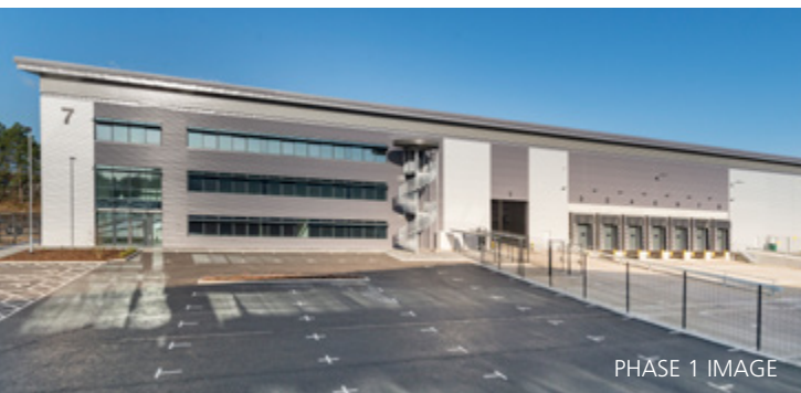
PHASE 1 IMAGE