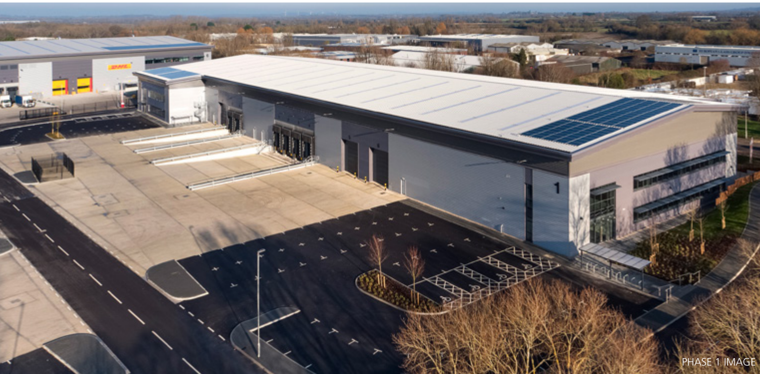
PHASE 1 IMAGE