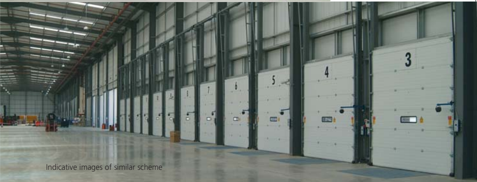
Indicative images of similar scheme