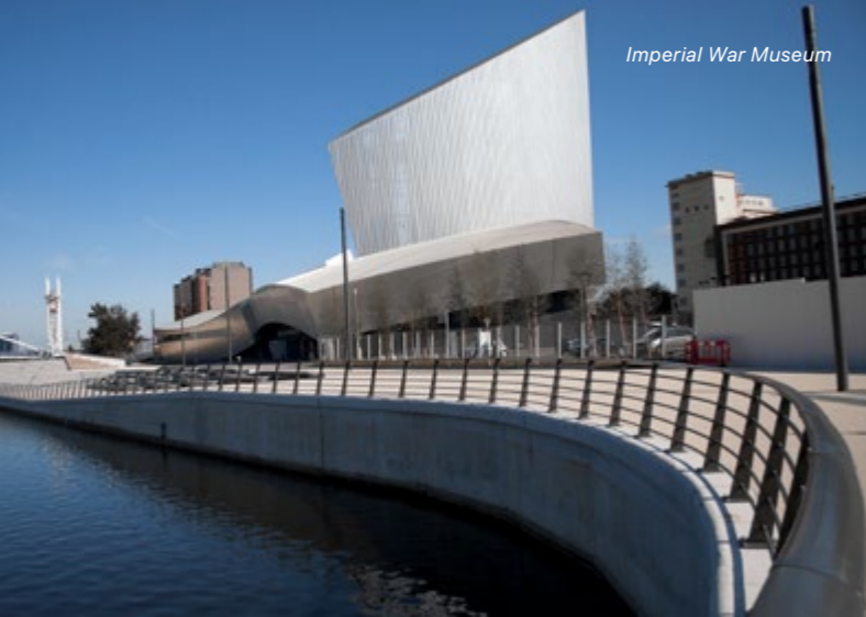
Imperial War Museum