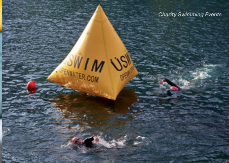
Charity Swimming Events