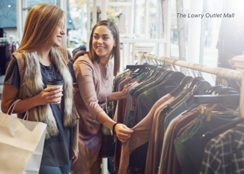
The Lowry Outlet Mall