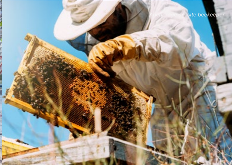
Historic on-site beekeeper