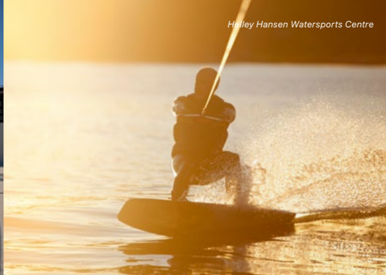
Halley Hansen Watersports Centre